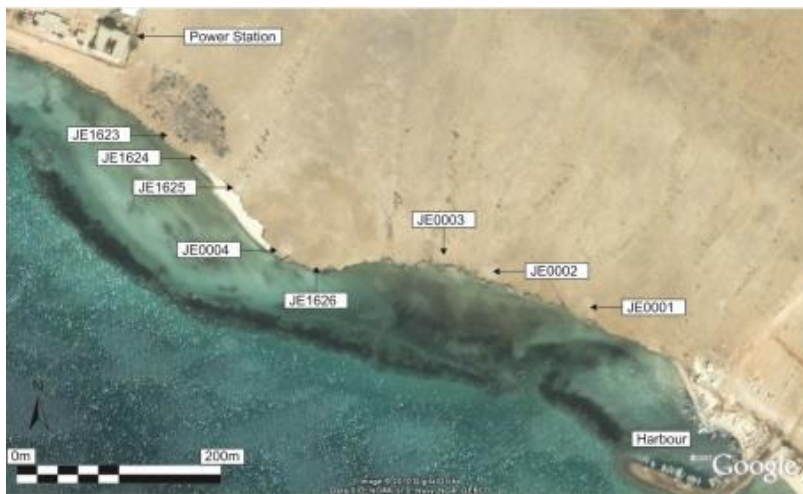
Figure 11. Google Earth image showing the location of the Janaba 4 shell mound and the other shell mounds in the vicinity, from which samples were collected. Map prepared by Matthew Meredith-Williams.